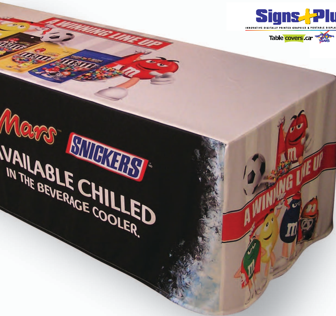
Table covers.ca 1984-2014 30 YEARS

INNOVATIVE DIGITALLY PRINTED GRAPHICS & PORTABLE DISPLAYS ... THAT WORK